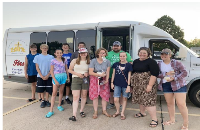
FLY Progressive Dessert