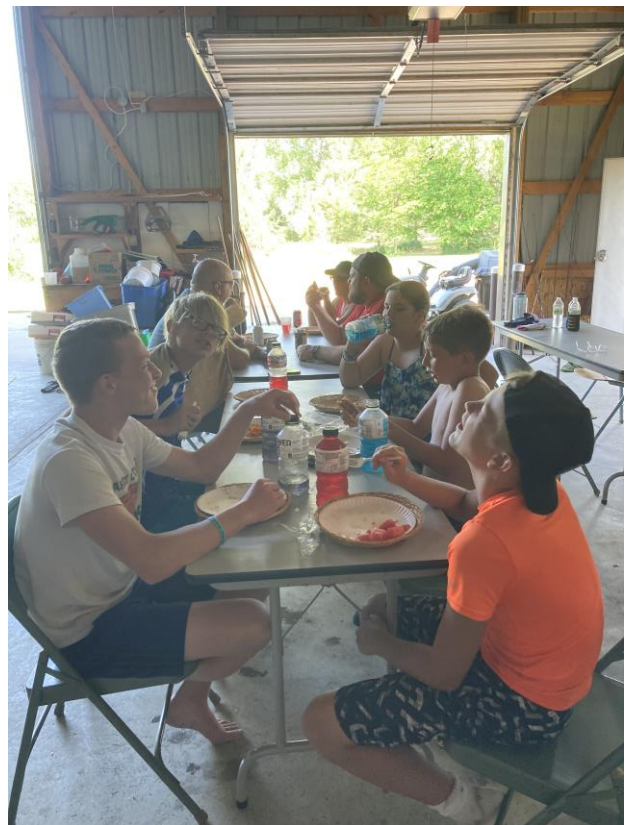
FLY & Confirmation Work (and swim and feast) Day @ Stithem's