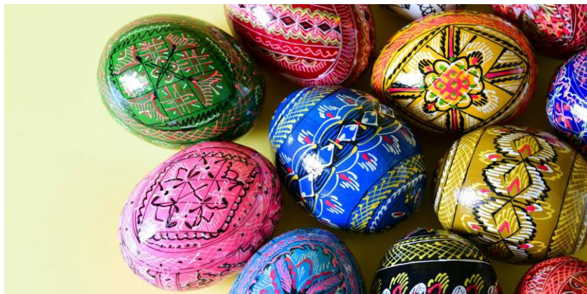
Traditional Ukrainian Easter Eggs

Saturday, April 30 th – Women's ELCA meeting – Centennial Hall