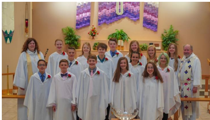
Class of 2023 ~ Confirmation Class in 2018

God goes with you into your next chapter!