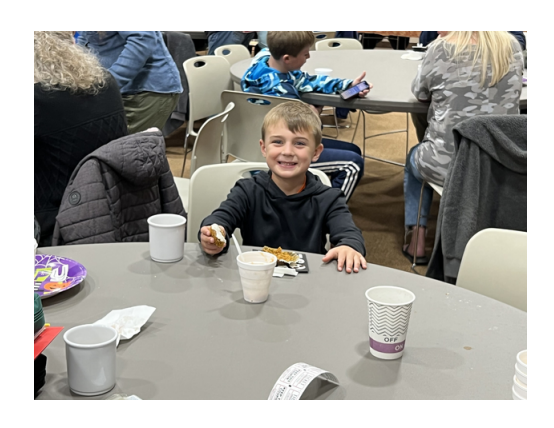
Join Us Sunday, August 27th Sunday school 9:55am-10:55am Worship @ Dryden Park 11:00am Potluck following the service