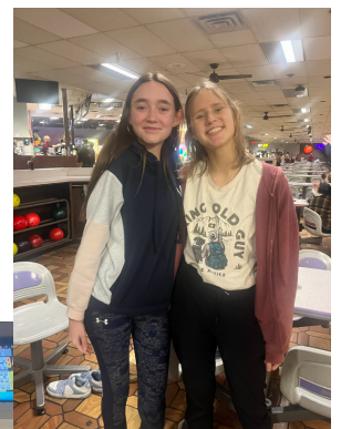
Big Apple Fun!