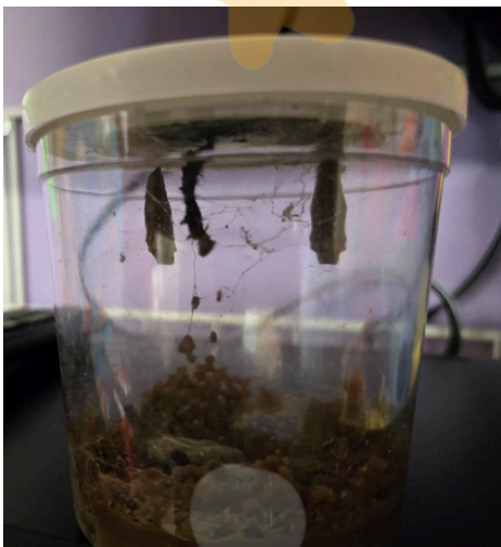
Learning about chrysalis