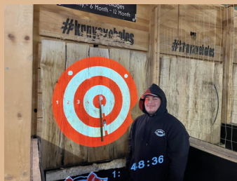
Ax Throwing Event from December