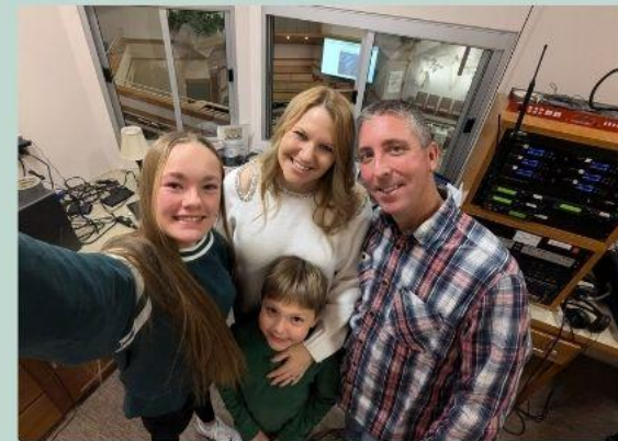
Sometimes the whole family helps!