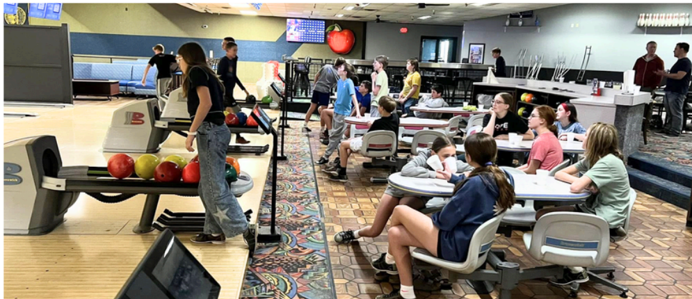
The Annual Confirmation Bowling night was a blast!