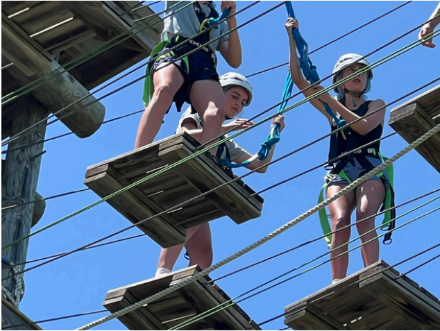
Our campers spent time on the high ropes course