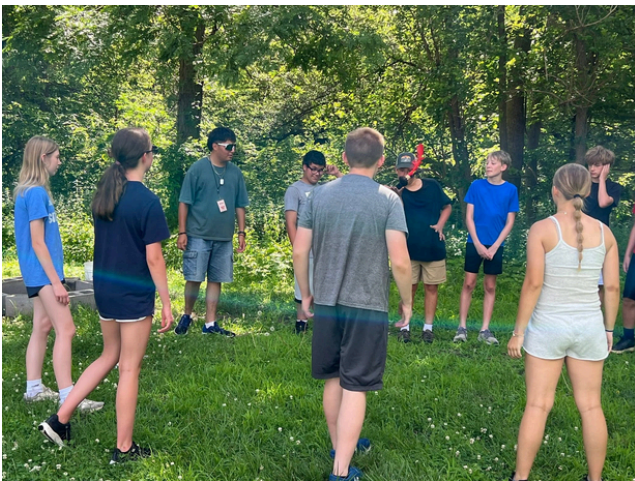
Co-Op time teaches valuable life skills and how to work with others.