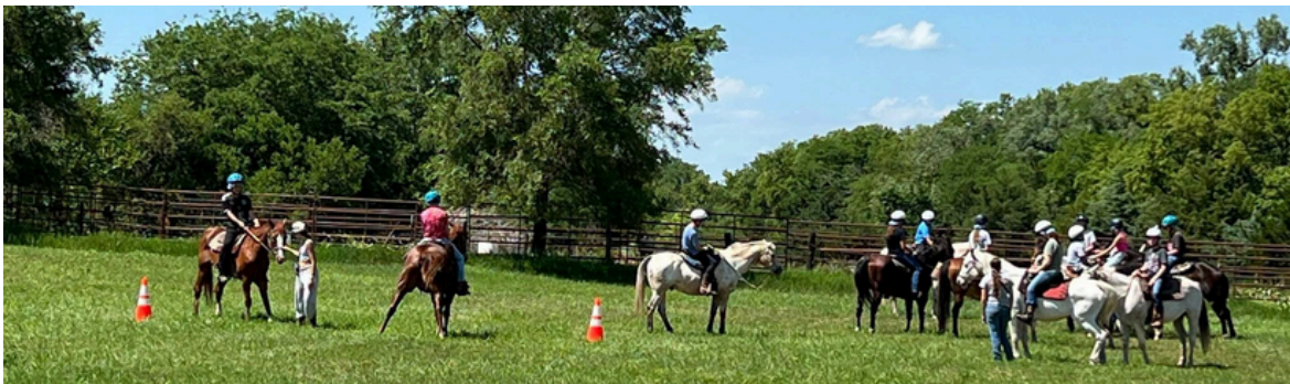
Horses, horses, and more horses!